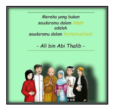
Figure 2: Promotional poster for the values of moderation.

At this stage, a class meeting of 50 students with the primary aim of imparting an understanding of the concepts and values of religious moderation was carried out. In this context, "values" refer to conceptions of what is desirable, influencing the selection of means, intermediate goals, final objectives of actions, fundamental beliefs, general behavioral guidelines, and serving as a standard by which certain actions are deemed good or desirable (Halstead & Taylor, 2005). During these meetings, students delved into the values of religious moderation across various topics. These discussions encompassed the meaning, objectives, urgency, and values of religious moderation, drawing from key reference sources in Islamic teachings. Topics included tolerance, balance, equality, peace, justice, humanity, countering radicalism and fanaticism, as well as respecting religious freedom within Indonesia's multicultural and multireligious context. The religious moderation conceptualization was spread across three meetings within two weeks. Following each meeting, students were tasked with creating quotes that promote the values of moderation. These quotes were then transformed into posters and widely disseminated through various social media platforms. An example of one such product quote is illustrated in Figure 2, featuring the expression: "those who are not brothers in faith are brothers in humanity."