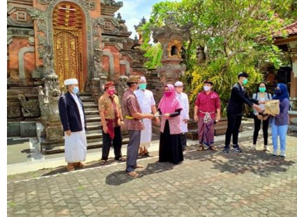
Figure 3: Delivery of Humanitarian Social Assistance to Orphanages