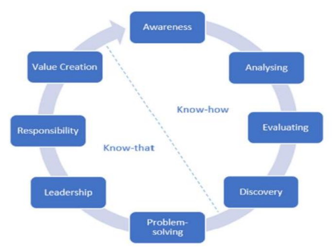
Figure 1. Entrepreneurship as a Process Model

Entrepreneurship as a process model is presented as a cycle of exploration, application, and evaluation of knowledge in entrepreneurship education. However, in practice, it has been found that the model is not particularly effective (Igwe et al., 2022).