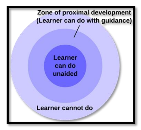
Figure 1. Zone of proximal development

In an effort to answer the research questions, the study adapted Vygotsky's (1978) peer scaffolding theory, which states that students' learning occurs when they are entangled in the situational context around them, and interact, communicate, and collaborate with one another, collectively contributing to building individual knowledge (Hanjani, 2019).