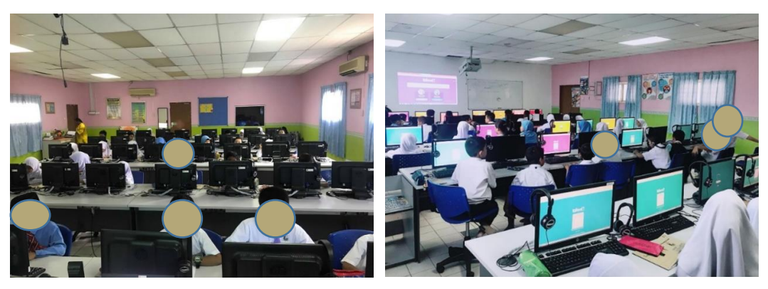
Figure 2: Kahoot! Session