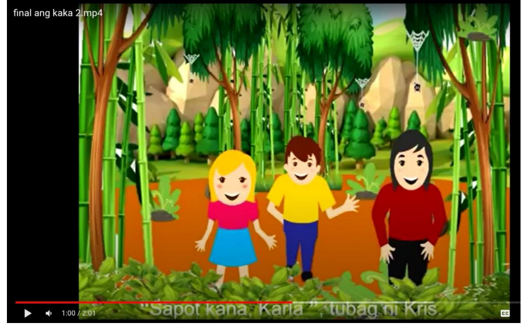
Figures 1 & 2. Screenshots of the e-material