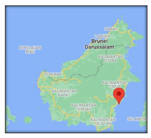
Figure 2. Research Site

The research was conducted at a private school in East Kalimantan, Indonesia, involving one elementary school, a principal, 31 teachers and two administrators of foundation, who manage the school. This school was selected because it was included in either Cluster C or B, as referred to by Harwanti and Rumiati (2021) (see Figure 2).