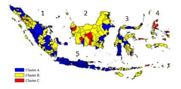
Figure 1: City Cluster Visualization (Harwanti & Rumiati, 2021) Note. Islands numbered as follows: 1. Sumatra; 2. Kalimantan; 3. Sulawesi; 4. Maluku; 5. Iava

Quality classification of elementary school education according to the National Education Standards (SNP, Standar Nasional Pendidikan ) in Indonesia was conducted by Harwanti and Rumiati (2021); the exercise involved 142,294 (100%) elementary schools in Indonesia, and it was found that a total of 63,477 schools (45%) were included in SNP. Another 44,680 (31%) elementary schools fell in the satisfactory category for meeting the SNP, 31,487 (22%) elementary schools did not fully meet the SNP, and 2,650 (2%) elementary schools did not meet the SNP. Harwanti and Rumiati used their findings to do city clustering by ranking. Clusters A, B, and C are schools that meet the SNP, schools that satisfactorily meet the SNP and schools that do not meet the SNP respectively. Schools in Clusters B and C are mostly located on Kalimantan Island of Indonesia (Figure 1).