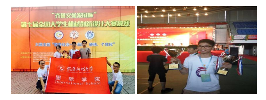
Figure 3 Gold Award in the "seventh National Innovation Design Competition"